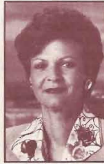
Hazel R. O'Leary

Over seventy-five representatives of Hudson Valley environmental and human rights organizations met on November 14, 1998 to plan strategies for working together on issues of common concern. The Conference was preceded by an open forum featuring former Secretary of Energy, Hazel O'Leary. Secretary O'Leary urged the audience to recognize that they must get political if they are going to advocate for human and environmental rights. "Pick the right candidates and hold them to account," she said. She suggested that organizations must arm themselves with information and create collaboration among those who don't usually collaborate.