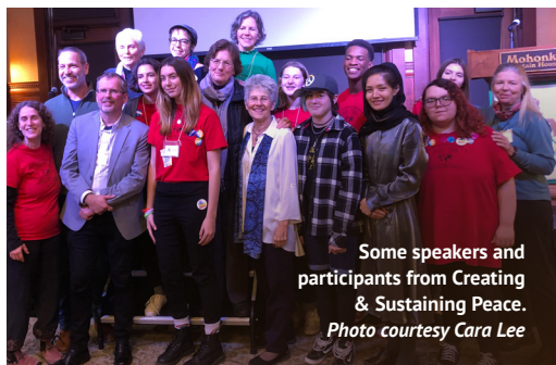
Some speakers and participants from Creating & Sustaining Peace.

"Peace is living in harmonious relationship with self, others and all life." — Dot Maver